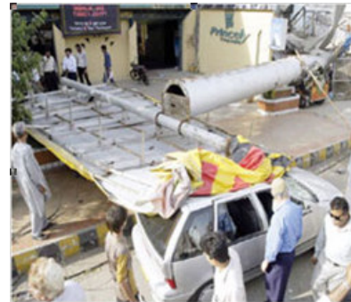
A billboard in Karachi destroyed among hundreds of others in after a typhoon ripped through the city